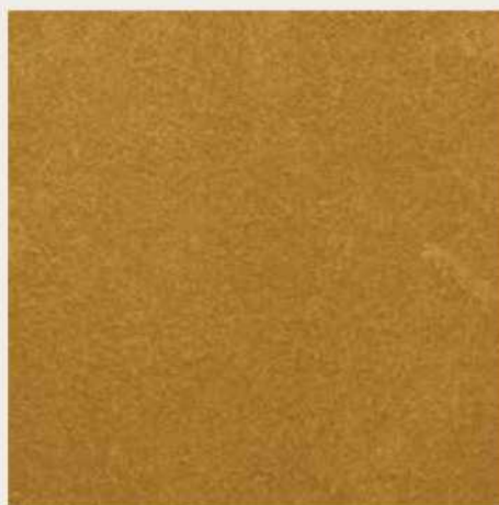
16071 ORO ROSSO