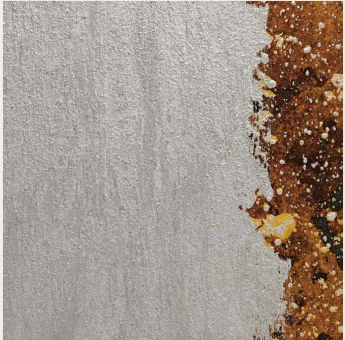
ZEUS ARGENTO + IRONic + W2F CLEAR FINISH BI-COMPONENT GLOSSY

Für weitere Info bitte siehe technisches Merkblatt.