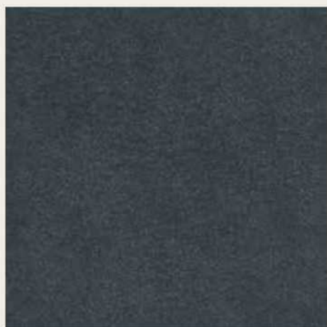
16072 ARGENTO OSSIDATO